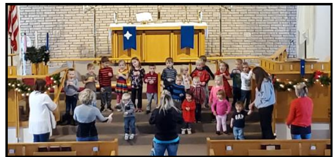
TLC Preschool Christmas Concert