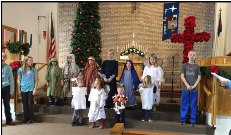
Practice for the Sunday School Christmas Program.