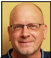
FROM THE PASTOR

We often hear in God's Word about our ancestors in the Faith—the men and women who have gone before us and show us what a life lived in faith before our Triune God looks like. They are sometimes called “patriarchs” and “matriarchs,” literally, the founding fathers and mothers. We look all the way back to Adam and Eve, the father and mother of the human race. We look to Noah, to Abraham, and their physical descendants—Isaac, Jacob, and the Twelve Tribes of Israel. We look to the men called to be prophets, apostles, and the martyrs throughout the ages. We also look to faithful women, like Sarah, Rebecca, Deborah, Naomi, and Ruth in the Old Testament; in the New Testament, we look to Mary, the mother of our Lord Jesus Christ, Salome, Mary Magdalene, the sisters Mary and Martha, and others who followed Jesus all the way to the cross; we look to Eunice, Lois, Priscilla, and Phoebe, women who served the people of God in the first generations of the New Testament Church.