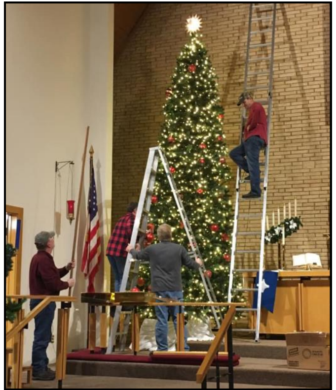
Putting up the Tree