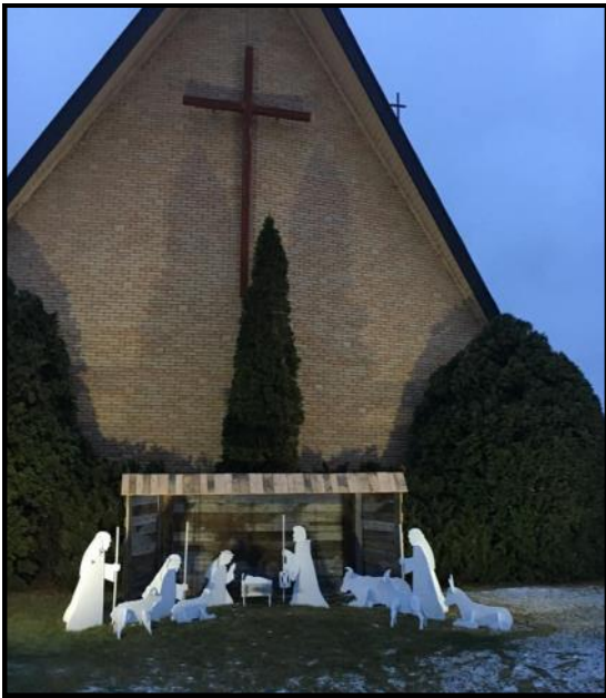
Trinity's Men's group made a new Nativity for the church lawn.