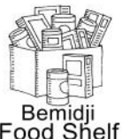
Bemidji Food Shelf

Trinity, along with United Methodist Church volunteer the 3rd Monday of each month at the Food Shelf. The first shift is from 9am-12pm and the second shift is from 12-3:30pm. Both shifts need 6-7 volunteers.