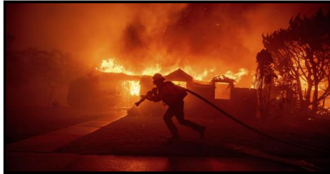
A firefighter battles the Palisades fire as it burns a structure in the Pacific Palisades neighborhood of Los Angeles on Tuesday, Jan. 7.